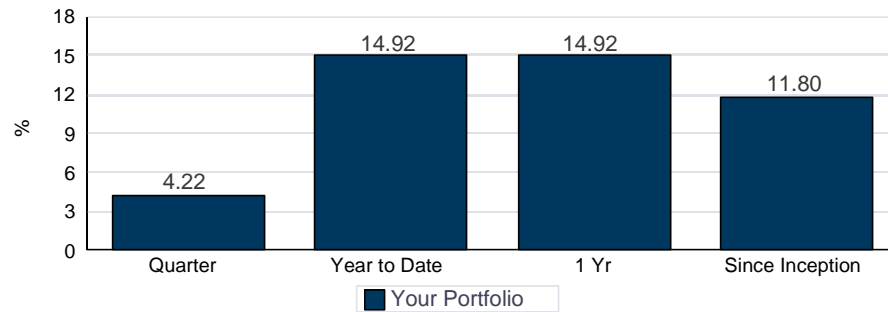
Time-Weighted Annualized Returns June 11, 2019 To December 31, 2020